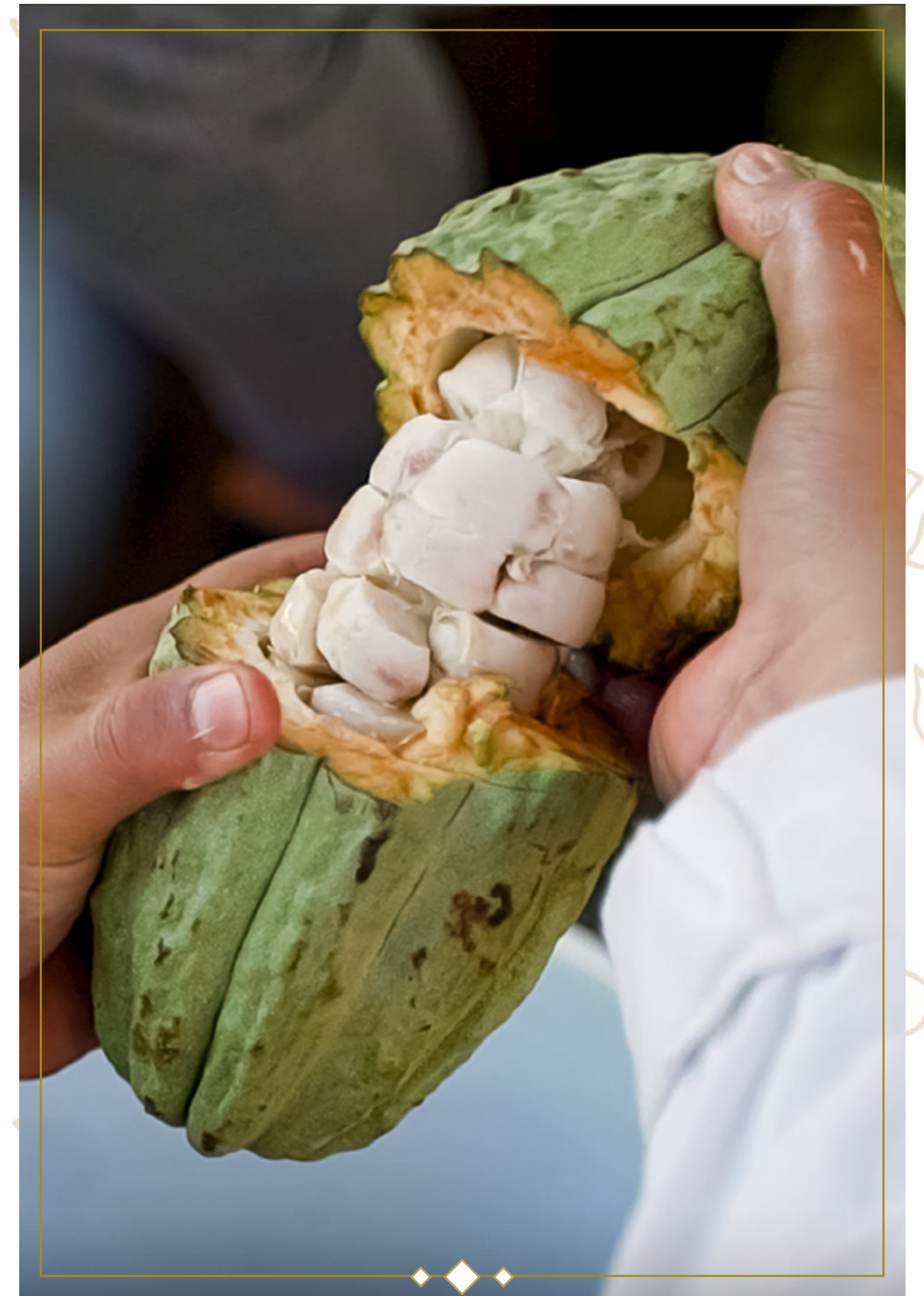
"Mary's hacienda Maya cacao criollo", harvest 2024, Mexico

Every chocolate lover should taste this pure flavor of perfection.